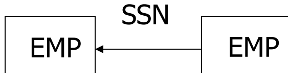
TABLE EMP {SSN, MGR_EMP} /* self-referencing */

R(n) \rightarrow R(n-1) \rightarrow \dots \rightarrow R2 \rightarrow R1 \rightarrow R(n) /* referential cycle */